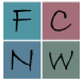
Fish Construction NW

"I was filling up with my Pacific Pride card while looking at the prices posted at the retail gas station on the same lot. On one fill up alone we saved almost $15.00. We have 4 vehicles using the OHBA program through Ed Staub & Sons. I did the math and figured out that we're saving close to $250.00 a month, based on current gas prices. This benefit alone more than pays for the cost of my membership, and supports our industry. It's a win-win for everyone."